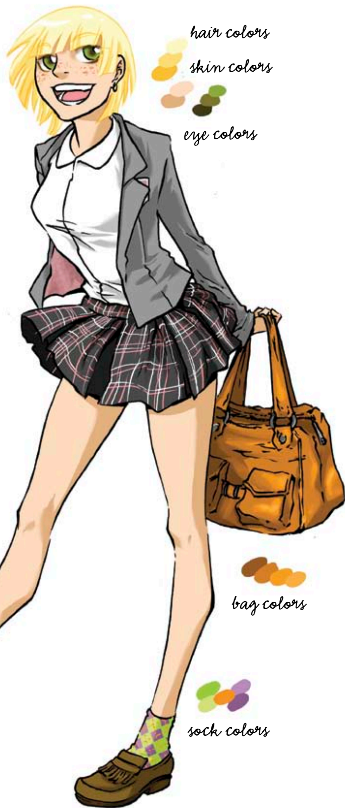
hair colors skin colors eye colors